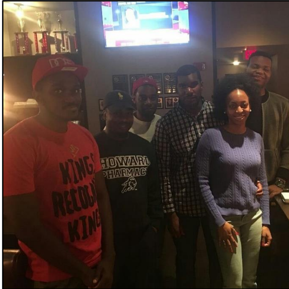
Brothers and guests gather to watch a General Election presidential debate.

Theta Rho Lambda brothers coordinated a series of debate watch parties throughout the election season this year. The debate parties were in support of one of our national programs: A Voteless People is a Hopeless People. The goals of the watch parties was to encourage people to become aware of candidates’ viewpoints and positions on an array of topics; to provide an opportunity for people to engage in dialogue with other people with either similar or opposing political perspective, and to, ultimately, help people become more informed voters. Brothers and members of the community convened at the Bus Boys and Poets in Shirlington, Va. on Feb. 6, Feb. 11, Sept. 26 and Oct. 19 to watch a Democratic and Republican Primary debate and two General Election debate. All of the debates yielded a good discussion among those present. The committee looks forward to engaging voters during the upcoming Virginia governor’s race.